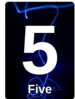
Player Power Card