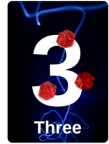
Influence Tokens for the Round

You will hold two Robot Cards each round, from four possible types; Immediate and Active abilities, Reveal cards, and Endgame cards. Immediate abilities are used when the card is played face-up on a player's turn. Active abilities come into effect when played face-up on a player's turn and remain in effect unless turned face-down again. Reveal cards may be played and used on a player's turn or may be held in reserve - along with an Action Token to spend on it - until the end of the round, where they may then be revealed and used. Endgame cards are revealed (for free) at the end of the round in which one or more players have acquired 10 Influence.