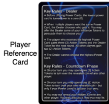
Player Reference Card

You will hold two Robot Cards each round, from four possible types; Immediate and Active abilities, Reveal cards, and Endgame cards. Immediate abilities are used when the card is played face-up on a player's turn. Active abilities come into effect when played face-up on a player's turn and remain in effect unless turned face-down again. Reveal cards may be played and used on a player's turn or may be held in reserve - along with an Action Token to spend on it - until the end of the round, where they may then be revealed and used. Endgame cards are revealed (for free) at the end of the round in which one or more players have acquired 10 Influence.