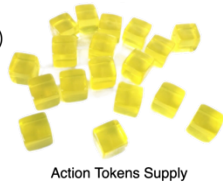
Action Tokens Supply

Influence Point Tokens (50x, 1s and 5s) Action Tokens (20x) Power Cards (10x, 0 through 9) Robot Cards (34x, Left and Right) Coins (18x)